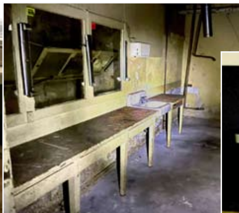
Entertainer dressing room with mirrors and tables.